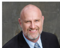
Elvis Grbac Retired NFL quarterback and motivational speaker.

OUTSTANDING MUSIC • SACRAMENT OF RECONCILIATION • MASS Continental Breakfast and Lunch